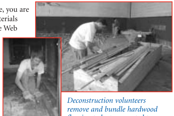
Deconstruction volunteers remove and bundle hardwood flooring to be transported to the ReStore.

Thanks ReStore staff and volunteers—you are making a difference.