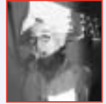
Cheesehead Jimmy Buffett

Although the temperature outside was a frigid nine degrees, Jimmy Buffett fans lined the sidewalks two hours early to make the Grand Opening Benefit Night of his restaurant, Cheeseburger In Paradise, a success. The third restaurant in this franchise opened on January 12, 2004 in Middleton, WI. Buffett thrilled his fans by playing his signature tropical island songs for the 250 guests for almost an hour. Just like the other two Grand Opening affairs, the Cheeseburger In Paradise partners designated the admission proceeds for a local charity. Unlike the other two events, this time they chose Habitat for Humanity of Dane County.