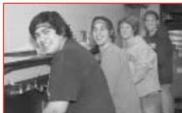
Students help wash dishes after the Souper Bowl fundraiser.

Summer building plans continue with a trip to Costa Rica and a short rest before starting UW House number four in Twin Oaks this fall.