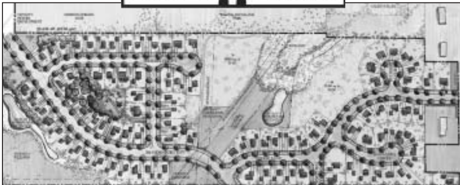
Twin Oaks Neighborhood, a mixed-income community by Habitat for Humanity of Dane County.