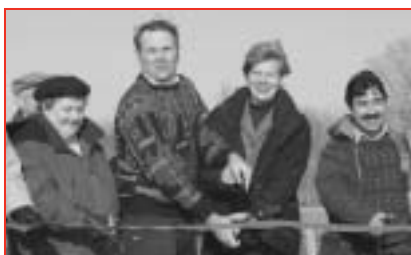
November ribbon cutting event celebrates completion of infrastructure.