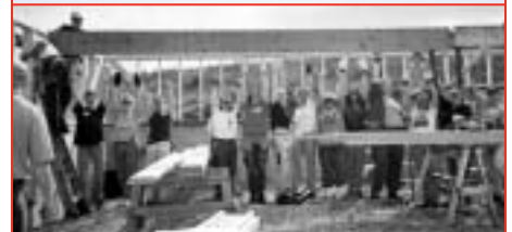
Women's build volunteers work hard to put up the wall frame.

The Women's Build Steering Committee is focusing on fund-raising, and is looking for volunteers to help staff booths, stuff envelopes, and make crafts or treats. Look for more information at the Women's Build Web site: www.habitatdane.org/current.womens.cfm