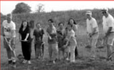
June 25- The Yang family, HFHDC staff and long-term volunteers celebrate the groundbreaking of 5312 Park Meadow, the fourth and final Park Meadow home.